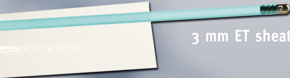
3 mm ET sheath with sanitary sleeve

Dedicated Accessories for Embryo Transfer