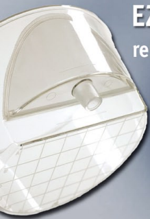
EZ Filter ref 017726