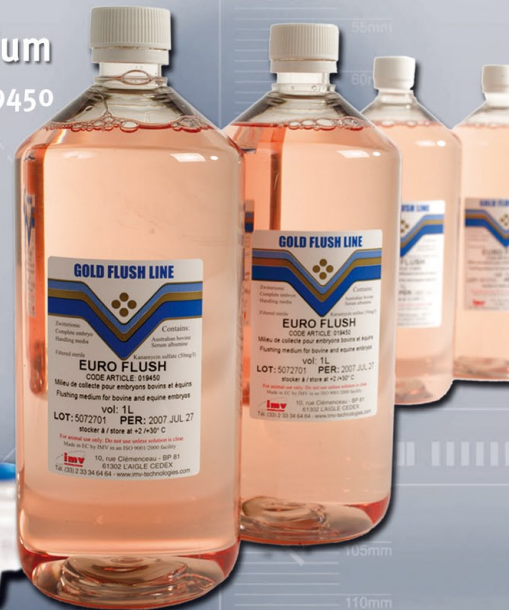
Euroflush Embryo Flushing Medium ref 019450