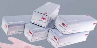
Red sensitive gloves Dispensing box - 100 gloves ref 021091