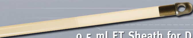
0.5 ml ET Sheath for D5-D8 Embryo Sterile - (Individually wrapped, by 10) ref 017532